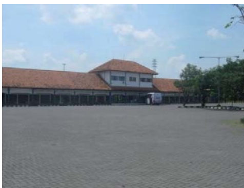
FIGURE 2. Jati Kudus Terminal which is quiet from passengers and public transportation (Baedhowi, 2018)

pany, became a freight terminal due to a decline in performance and service. It is connected to the Jati Kudus Terminal through Demak Regency and the North Coast (Pantura) route and links public transportation between Jakarta city and the Surabaya city, East Java Province. The Pantura route is a national road and a major alternative means of transportation on the Java island. Figure 2 shows the current quite condition of the Jati Kudus Terminal due to the limited number of passengers and public transportation. Figure 3 shows that the Terboyo Terminal is associated with the disruption of services due to the occurrence of tidal floods from the Java sea coast. The coastal area adjacent to this terminal was initially a mangrove forest with the ability to withstand a tidal flood, however, it has been converted into public facilities and infrastructure. Figure 3 shows water inundating the Terboyo Terminal area due to tidal flood from the Java Sea. The Jati Kudus Terminal management needs to learn from the failed experience of the Terboyo Terminal in providing infrastructure.