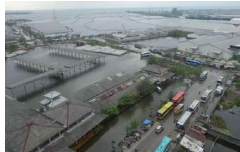
FIGURE 3. The terminal which is flooded due to tidal flood from the Java Sea (Purbaya, 2017)

Terminal becomes a node of changing modes of transportation for passengers and freights. Terminals can connect many areas with transportation activities that are the main needs of the community. This is because the terminal plays an important role in connecting regions (Idicula, Syam, Joseph & Harithamol, 2016). Road transport terminals can connect between regions in Indonesia as an archipelago country separated by many oceans that have high disparities in all development sectors. The national development can be evenly distributed throughout the region supported by transportation infrastructure including road transport terminals. Even development throughout Indonesia can reduce the level of disparity in the economic and investment sectors. Road transport terminals are also integrated with other infrastructures within urban and rural areas. Urban and rural areas can be connected with transportation infrastructure to realize the interaction between the two regions, thus preventing the negative impact of urbanization. Jati Kudus Terminal is connected to international airports, international seaports, and national railway stations in Indonesia's Central Java Province. Road transport